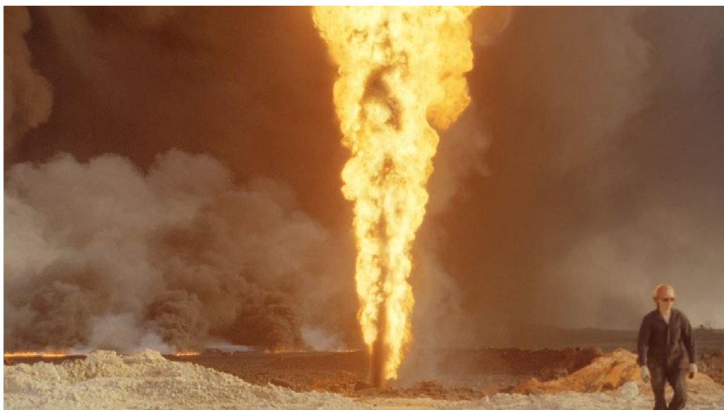
— Figure 6 Werner Herzog, Lessons of Darkness (1992)

The whole process put in place from the nineteenth-century onwards, one that involves extraction, transportation, refinement, and finally, use, is concealed from our gaze; when we see it, as in oil spillages, for instance, something has gone wrong. The oil fires are an extreme example of this infrastructural malfunctioning; in several of Salgado’s shots we see a juxtaposition of industrial materials used in the oil wells before the bombings, and a series of military equipment, such as army tanks and trucks, now partially sunken by the oil-infested sand/mud. This is also present, if in a somewhat more eerie setting, in Herzog’s long shots filmed from above, slowly cruising through a desolate landscape in which the Gulf War gives way to a “futuristic environmental war, a war waged against the no-man’s-landscape” (Bozak 2011, 77).