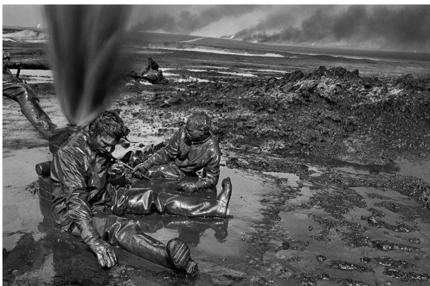
Figure 8 Sebastião Salgado, Kuwait: A Desert on Fire.