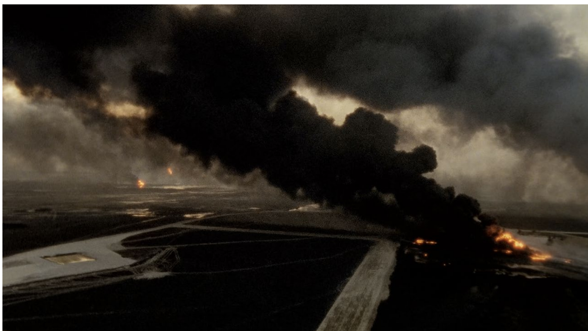
Figure 7 Werner Herzog, Lessons of Darkness (1992)

Making an analogy with Thacker’s analysis of the horror genre, in which certain media are infused with the supernatural, or the paranormal, we can say that the mediation brought about by the Iraqi bombs, the moment of their explosion on the surface of the oil fields in Kuwait, allows for a different access to the earth as narrated by oil . The primary media here, as it were, would be the bombs and the ensuing physical processes unleashed by their explosions, and our culturally-codified endeavors — film and photography — would only witness the extent of this excommunication , a fundamental inaccessibility to grasp earthly phenomena. From this perspective, the horrifying nature of the catastrophe gains a new significance; Salgado’s and Herzog’s shots are horrifying ones, not because they show the horrible consequences of the oil fires, but because they touch upon the moment in which “the communicational decision reaches a point of crisis” and we see glimpses of “an enigmatic, inaccessible, and mysterious ‘outside’” (Thacker 2013, 125). As Woodard (2013, 83) notes, “the earth... does not require much labor to become a monster.”