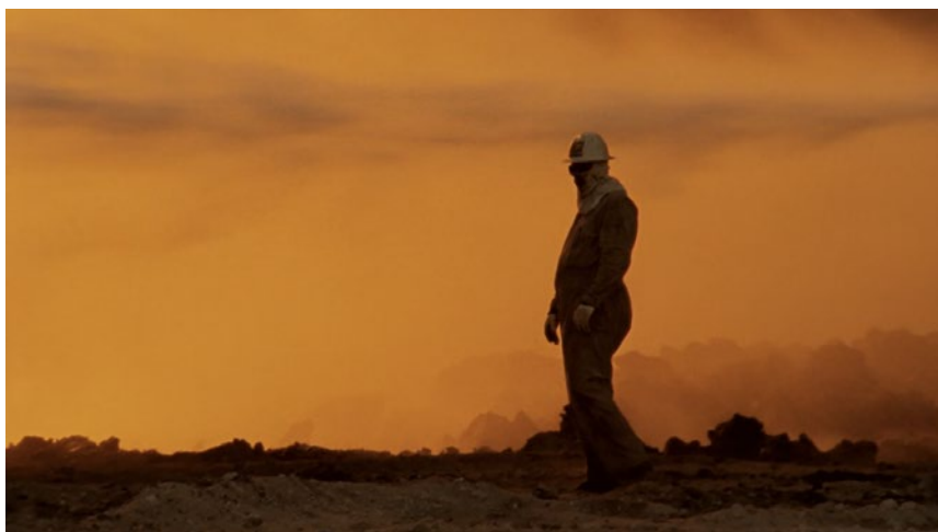
Figure 9 Werner Herzog, Lessons of Darkness (1992)

While fully escaping the aforementioned naïve connectivist ecological approach, it does not foreclose another way of relating to the anonymous materials that surround us. This is especially visible in the two works in appreciation here, where the production of oil is a sort of “polity of the inhuman.” 4 Its violent insurgency need not be seen as a revolutionary gesture of liberation (this would be a facile reading, and one that misses the crucial point of Negarestani’s work), but the signal that our proximity, the comingling of human and inhuman, the more-than-human mesh that keeps resurfacing in recent ecological discussions, has dark, inaccessible sides, ontological holes composed by spaces of nonexchange.