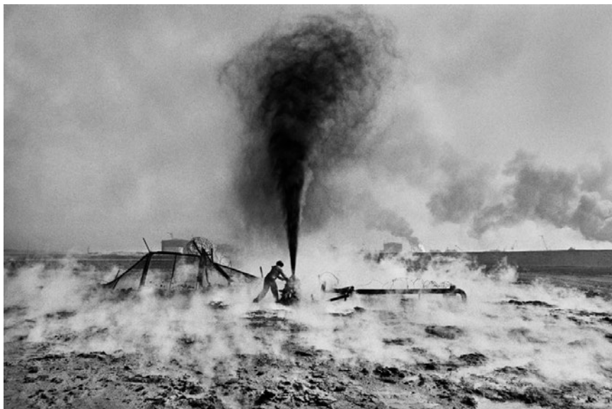
Figure 2 Sebastião Salgado, Kuwait: A Desert on Fire.

doubles as both the main theme and the literary device that pushes Negarestani's argument forward, is oil; in Pinkus' (2016, 76) apt words, " Cyclonopedia would lead us to believe that oil — today — is not only the lubricant of narrative, it is narrative, the only narrative, all narratives".