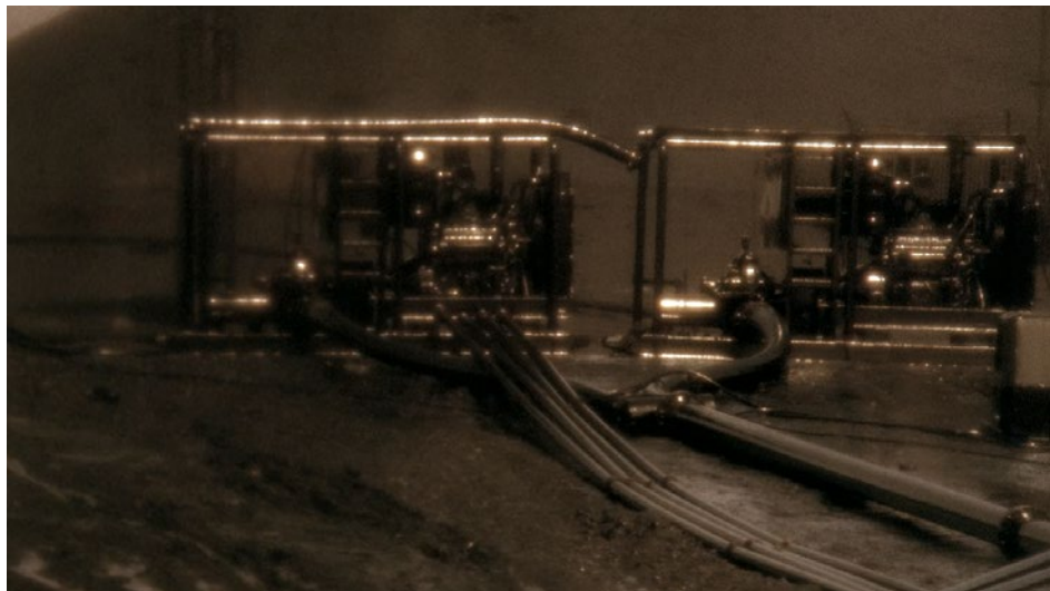
Figure 3 Werner Herzog, Lessons of Darkness (1992)

decipher it; at its center, oil, the “Tellurian Lubricant,” is “the viscous matter into which all narratives, all world views, all ideologies collapse and move forward together,” as Mason (2020, 112) stresses in his reading of Cyclonopedia .