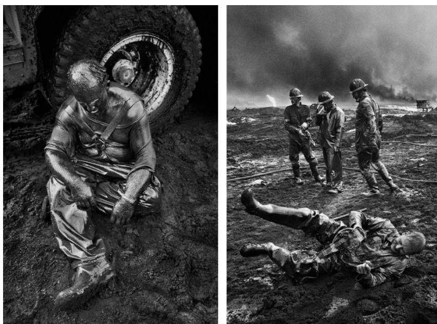
Figure 5 Sebastião Salgado, Kuwait: A Desert on Fire .

We are, thus, in neither of these cases — in the capital-T, mysterious and only poetically approachable Truth, or in the social realist, mundane and prosaic truth — in the realm of Negarestani’s weird, speculative materialism. In Cyclonopedia , we don’t seem to get closer to any aesthetically-inflected transcendental sublime, but the Iranian philosopher’s approach also does not afford any naïvely realist concessions. Instead,