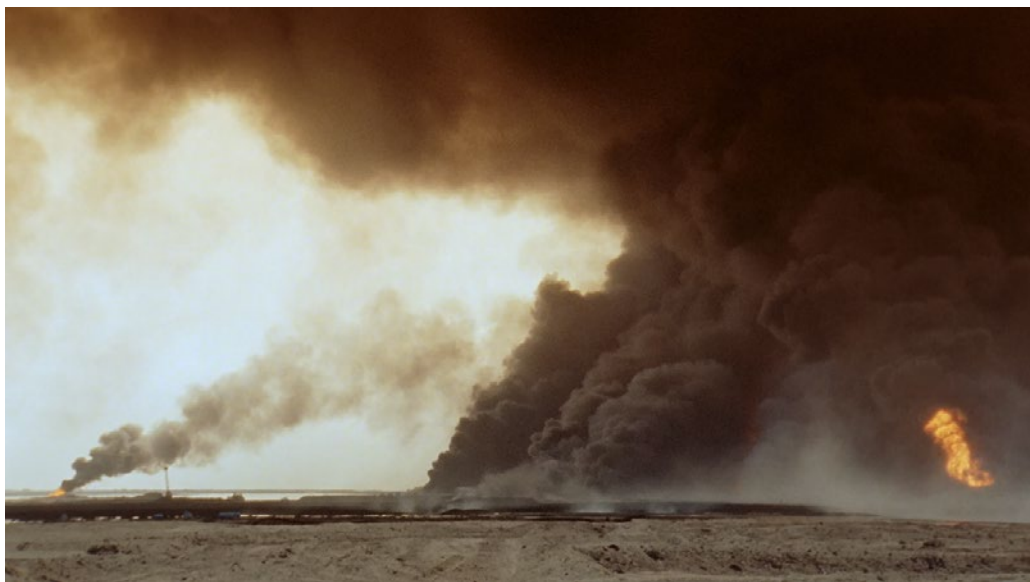
Figure 1 Werner Herzog, Lessons of Darkness (1992)

Oil is narratively slick . “The Oil Encounter” in the mid-nineteenth century — our “discovery” of a dark substance that we knew existed, but whose full potential as a general source of energy was hitherto unknown — produced, strangely, very little literary depictions in the following decades. Amitav Ghosh’s (2006, ebook ) now canonical article first published in The New Republic in 1992 explores the reasons behind the narrativization problems surrounding oil, pointing to the substance’s literal and metaphorical “bad smell”: