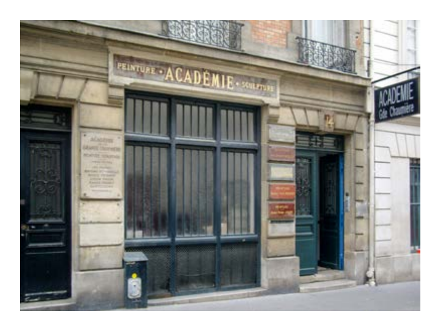
Figure 2 Académie de la Grande Chaumière Paris, France

Situated on the Street of Grande Chaumière in Montparnasse, despite its name, the school was an independent institution that offered private courses in painting and sculpture free from the academic restrictions imposed at the School of Fine Arts (École des Beaux Arts). Also, at the Academy, he met other Black artists and intellectuals and became a good friend of South African artist Gerard Sekoto, who had also moved to Paris in 1947 (Eyene 2010, 432).