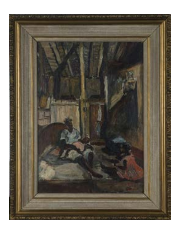
Figure 5 Wilson Tibério Bahia, 1946 Oil on canvas, 66,5 cm x 46,5 cm Courtesy: Gallery Aldo Locatelli Photograph: F. Zago/StudioZ Municipal Secretary of Culture Porto Alegre, RS, Brazil.

In Paris, through his contact with Sekoto, Tibério met Léopold Sédar Senghor, who became the first President of independent Senegal, a few years later. Because of this meeting, both Sekoto and Tibério were invited to attend the first Conference of Black Writers and Artists (Congrès des écrivains et artistes noirs) in Paris in 1956 (Mudimbe 1992, 372). The event was convened by the magazine and publisher Présence Africaine ,