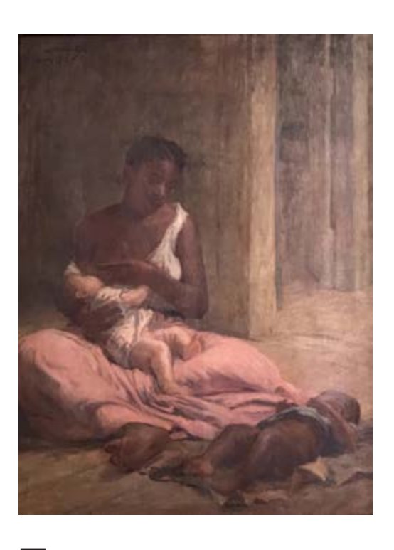
Figure 4 Lucílio de Albuquerque Mãe preta (Black Mother) Oil on canvas, 1912 Museu de Arte da Bahia, Salvador, BA, Brazil.

Black persons, either collectively or individually, always occupy a central place in Tibério's paintings. Among the various topics developed in his paintings are Black urban daily life, Candomblé ceremonies, and Black motherhood. Unlike most visual representations, in engraving, photography, painting, and sculpture, representing Black women during slavery and in the post-abolition period (Figure 4), in Tibério's works, Black mothers are not depicted as wet nurses. Although portrayed in settings where they live in poverty, the painter features Black mothers breastfeeding their own children and not the children of their owners or employers (Figure 5).